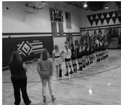
The Varsity Volleyball girls come together in a huddle before the home game against Iowa Valley on Tues., Sept. 15.