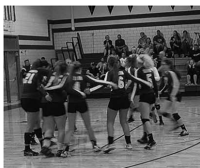
The KHS Volleyball team joins hands while the National Anthem is sung.

PHOTOS BY KYLEA TINNES • CAPTIONS BY ELISE SWANSTROM