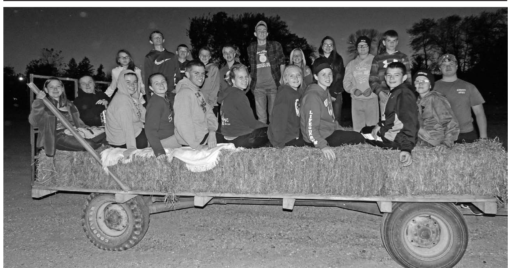
The Keota Junior and Senior High FFA Members gathered on Wed., Oct. 14 for their annual hayride and bonfire. This is an annual event held to kick off the new school year. A fun evening was enjoyed by all.