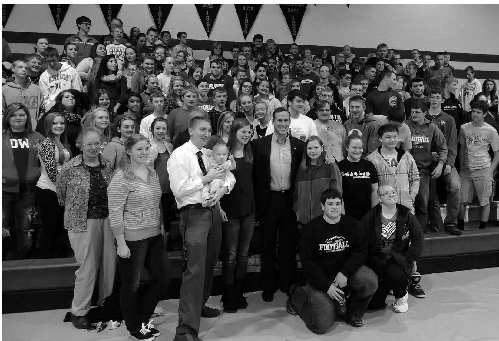
Students, teachers, and community members gathered around Senator Rick Santorum to commemorate a historical event in Keota High School history on Wed., Oct. 14, 2015. The presidential hopeful spoke about his political beliefs and answered questions regarding his position on various topics.