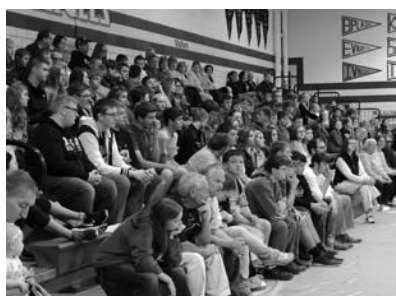
A large crowd of community members and students gathered to hear Rick Santorum speak at the KHS gymnasium.