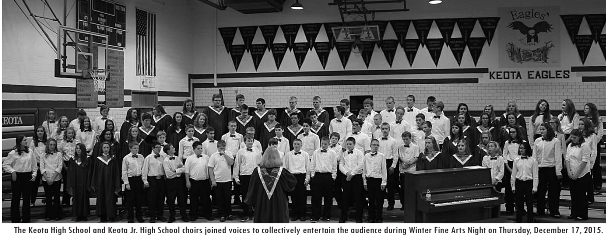
The Keota High School and Keota Jr. High School choirs joined voices to collectively entertain the audience during Winter Fine Arts Night on Thursday, December 17, 2015.