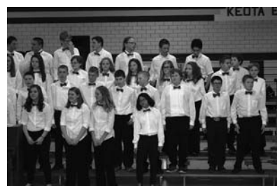
Above, the Keota Jr. High School choir prepares to entertain the crowd with their musical talents.