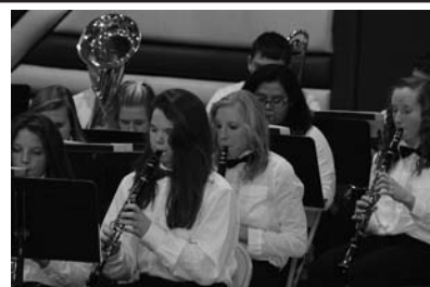
Keota Jr. High and High School clarinetists shared their talents during Fine Arts Night on December 17.