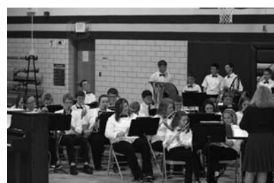
The Keota High School and Keota Jr. High School bands joined together to display their talents during Fine Arts Night on Thursday, December 17, 2015.