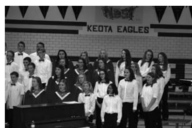
The Keota High School and Jr. High School choirs sang a couple of pieces as a large group during the evening.