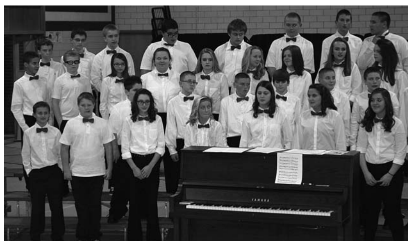
Pictured is the Keota Jr. High School Choir getting ready to perform at Fine Arts Night on December 17.