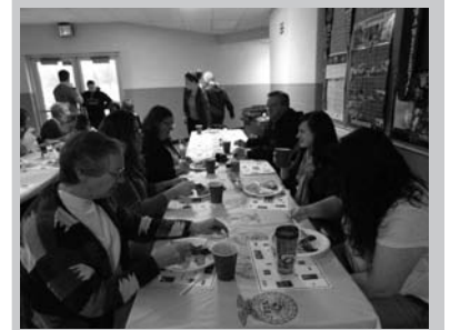
Staff members enjoyed the Staff Appreciation Breakfast provided by the FFA on Wed., Feb. 24.