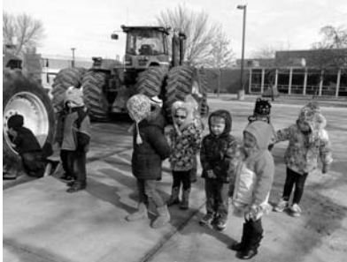
The Purple Preschool class takes a look at all the tractors.