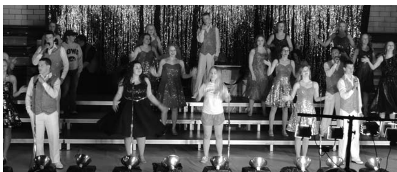
Pictured are the former and current EagleRock! members doing a throw back song with former members of the show choir.