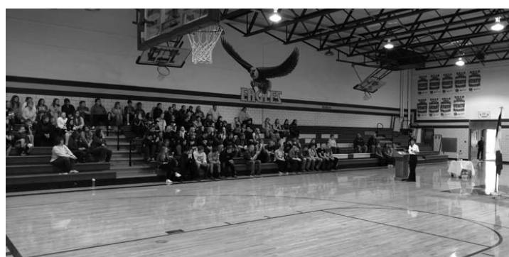
Keota High School students, staff, and members of the public gathered for a Veteran's Day Assembly at the KHS gym on Friday, Nov. 10.