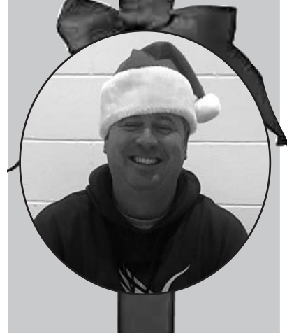
Mrs. Wolf Prime Rib