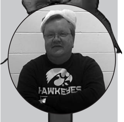
Mr. Stout Shrimp Dip