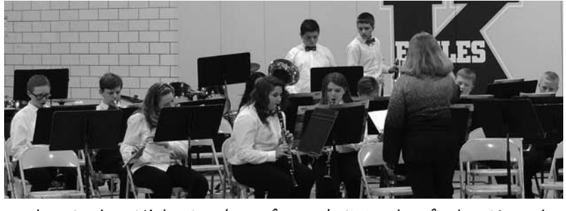
The Junior High Band performed "March of the Hyperion Guards" and "Drama for Your Mama."