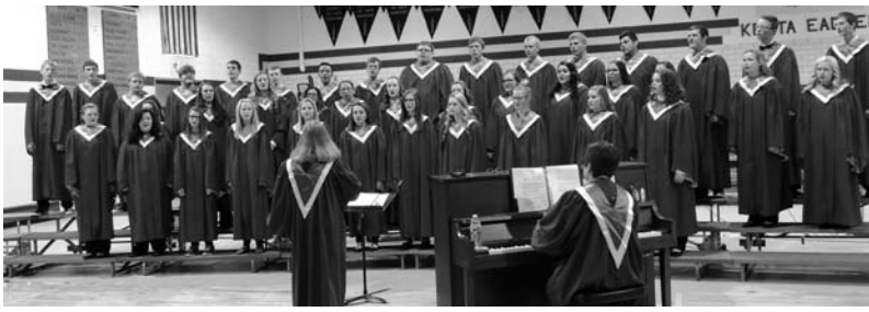
The Keota High School Chorus sang "Seasons of Love," "Going Up to Bethlehem," and "Na, Na, Na" at the Winter Fine Arts Concert.