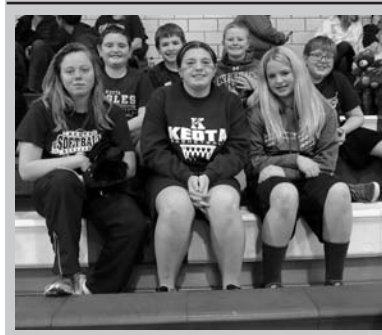
BY RAIGAN SPROUSE