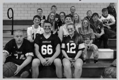
The freshman class is ready for Anything Goes wearing their favorite team jersies