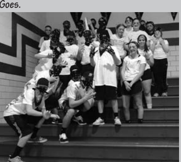
Pictured above is the 8th grade class dressed as the Skunk River Gana