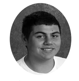
A HUNTER, BECAUSE YOU CAN'T SEE ME