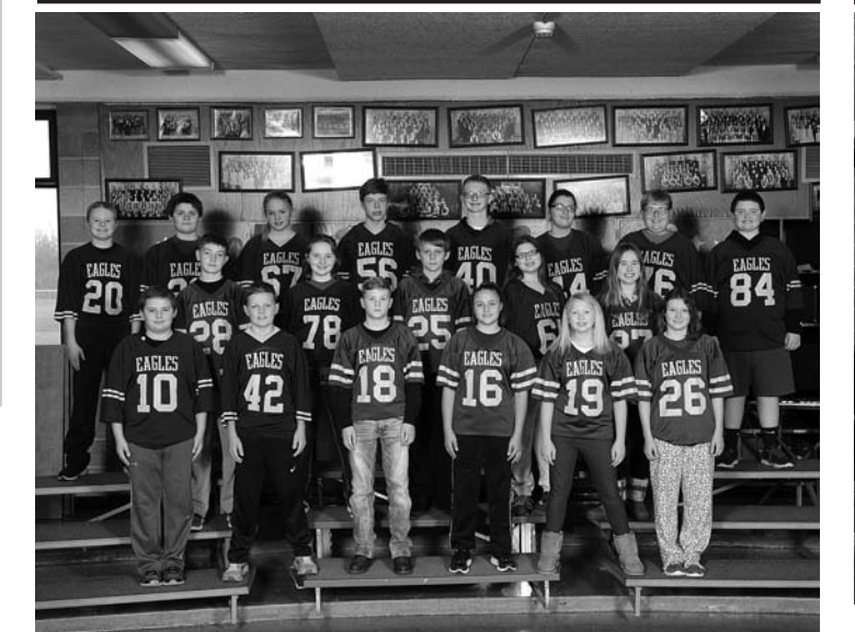
JUNIOR HIGH SCHOOL CHOIR