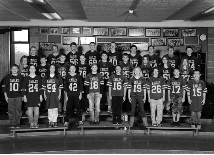
Pictured is the 2017-18 Keota Jr. High School Choir. From