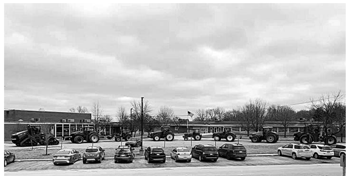
FFA students brought in tractors and lined them up in the circle drive for Tractor Day on Friday, Feb., 28.