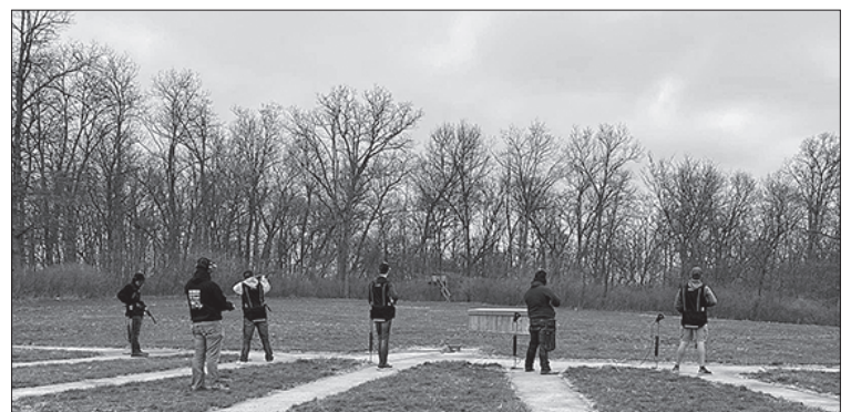
The SK trapshooting team aims down range at their targets.